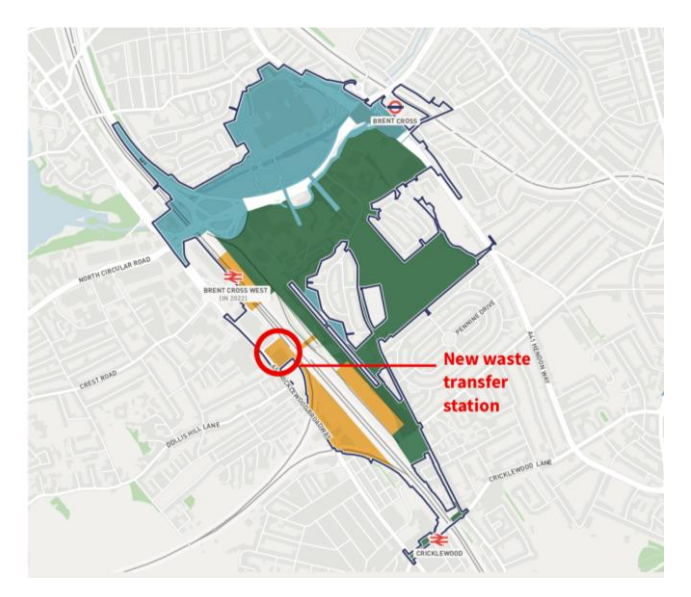
Plan of the site with Brent Cross Thameslink in yellow and green and blue representing wider regeneration scheme

This will enable the construction of a new train station and a new town centre for north west London as part of the Brent Cross Cricklewood regeneration scheme bringing new homes, work and leisure opportunities to the local area.