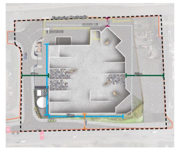
Impression of internal finished arrangement

Tel: 07393 752 666 christopher.donnelly@graham.co.uk