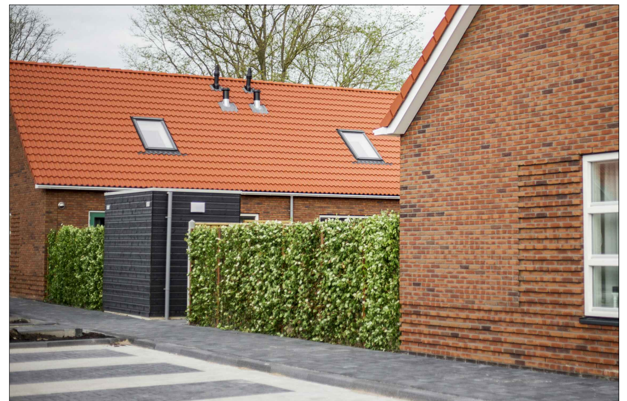
4 Precedent Image: Green Screen Scale NTS