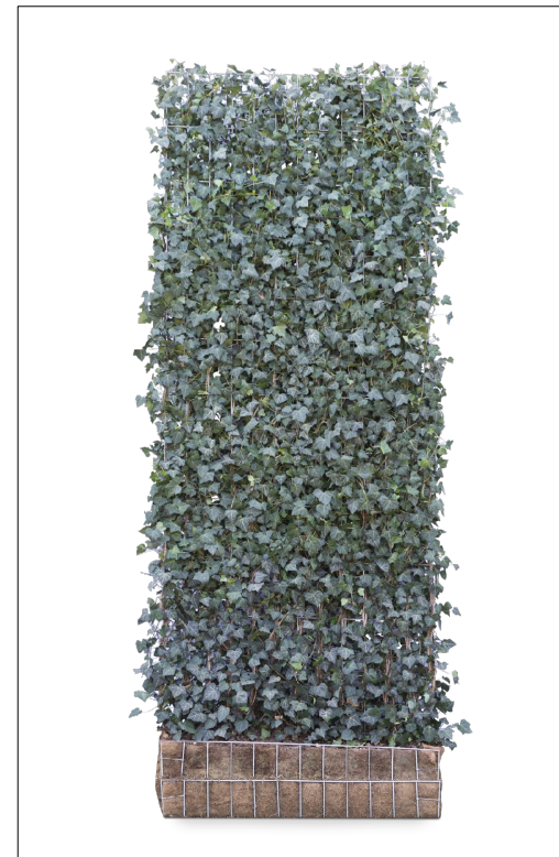
3 Product Image: Typical Green Screen Scale NTS