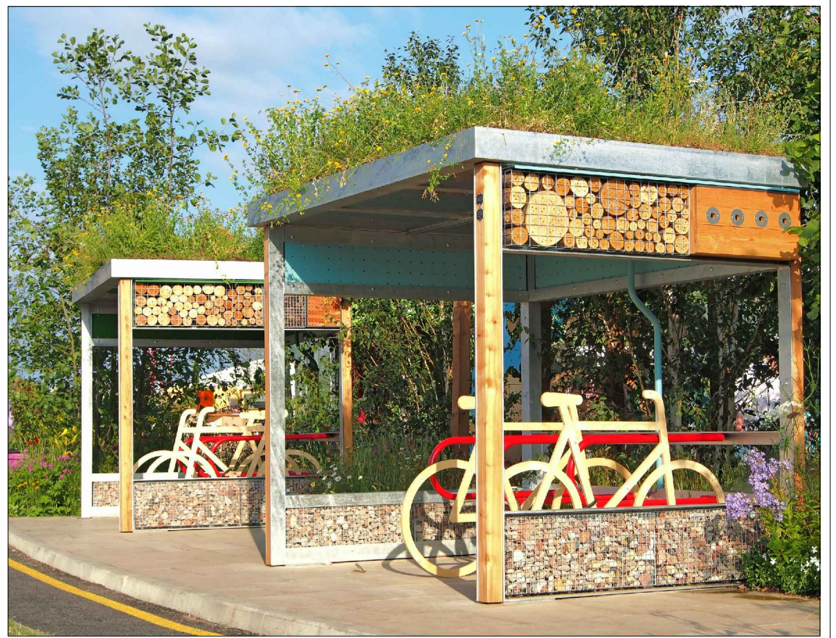
3 Image 0019 Scale nts

Note: Cycle Shelter shown on this drawing: