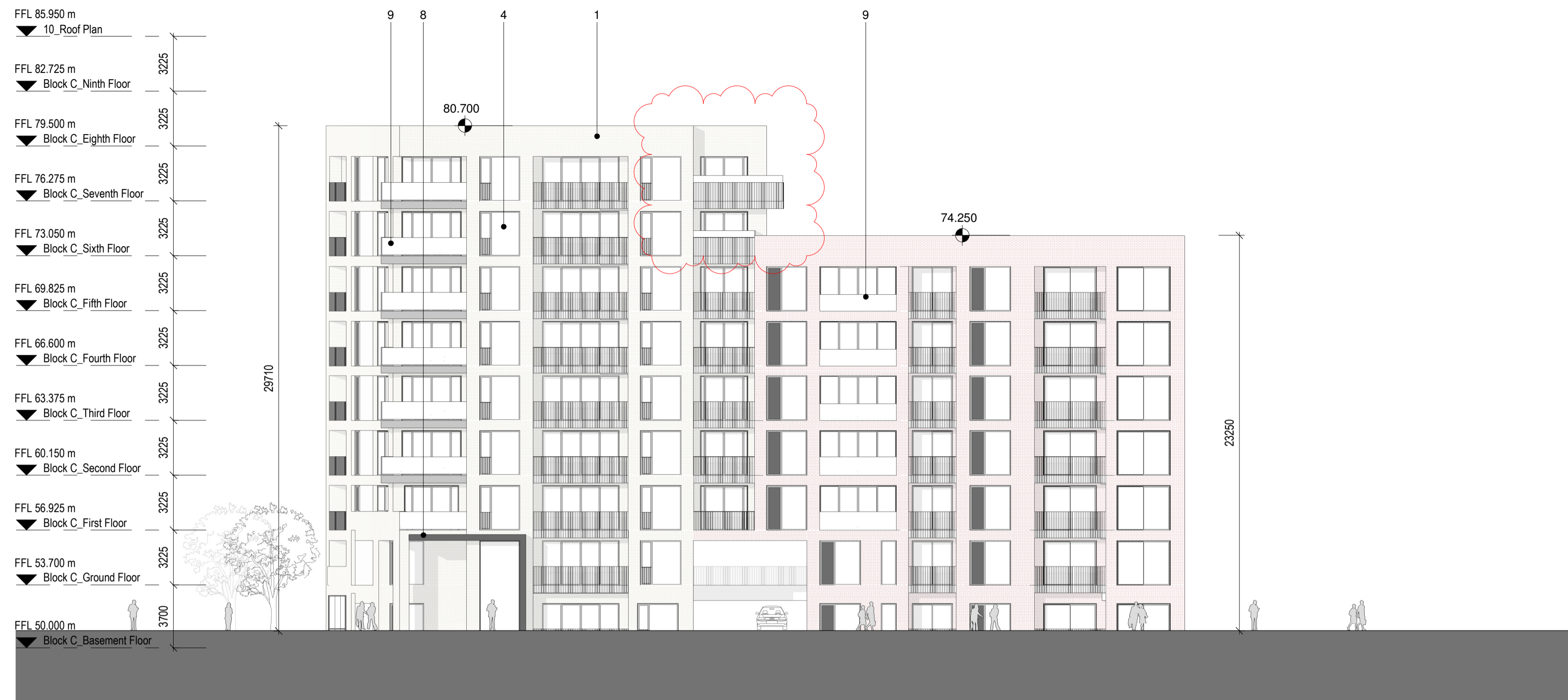
1 Block 1C_South Elevation 1 : 200