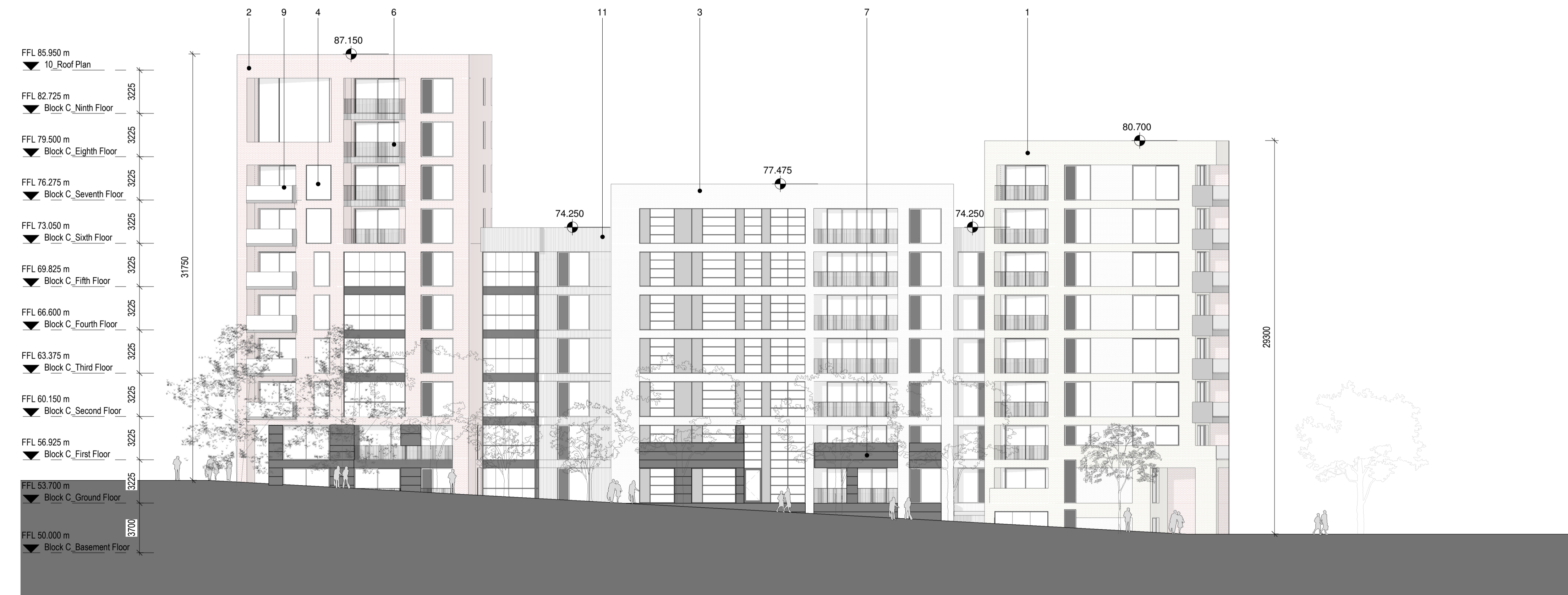
2 Block 1C_West Elevation 1 : 200