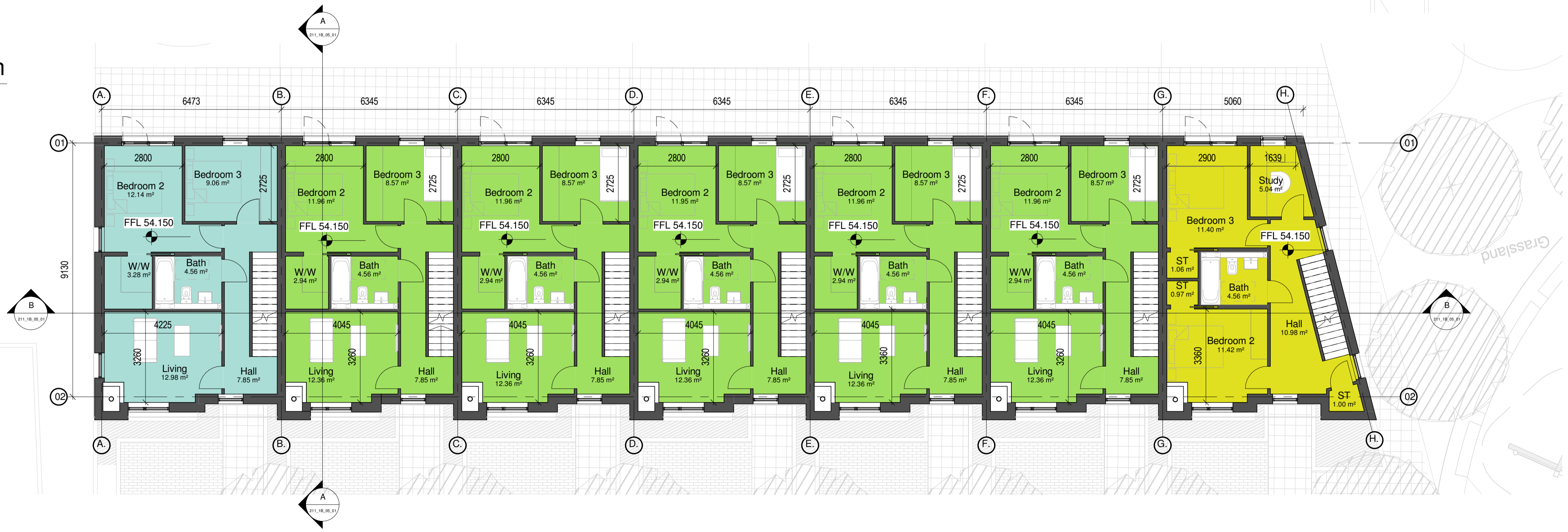
2 Block 1B_First Floor Plan 1 : 100