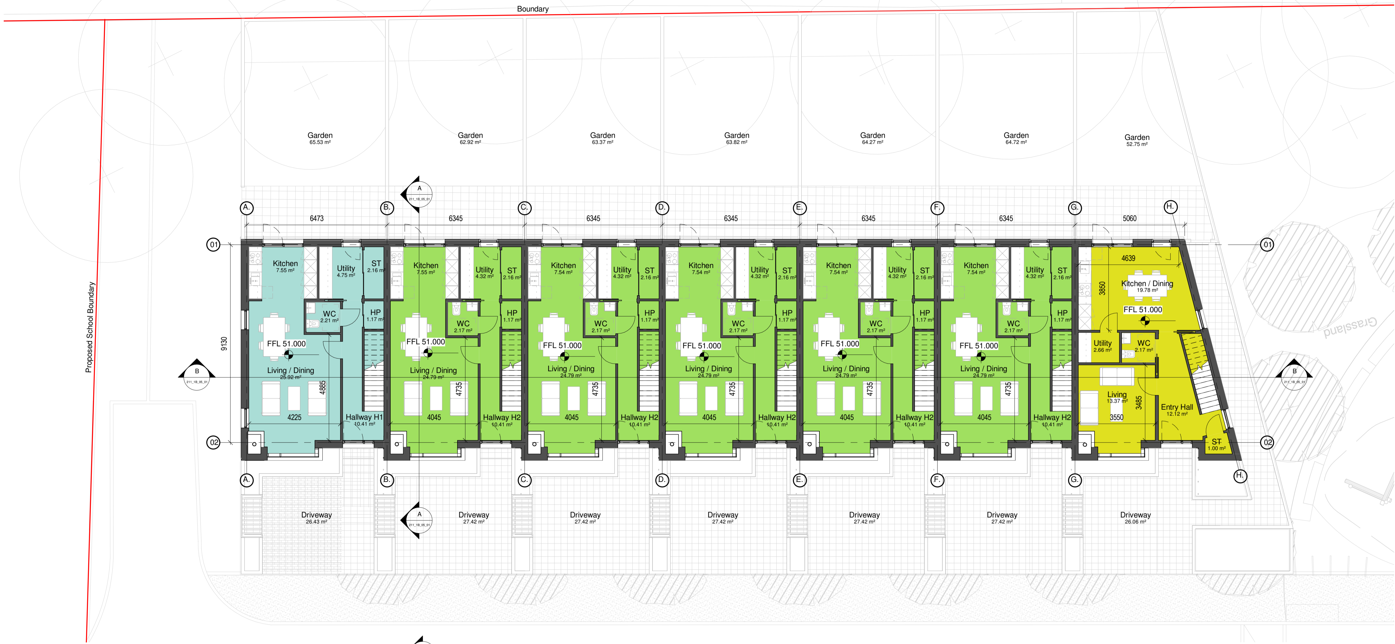
1 Block 1B_Ground Floor Plan 1 : 100