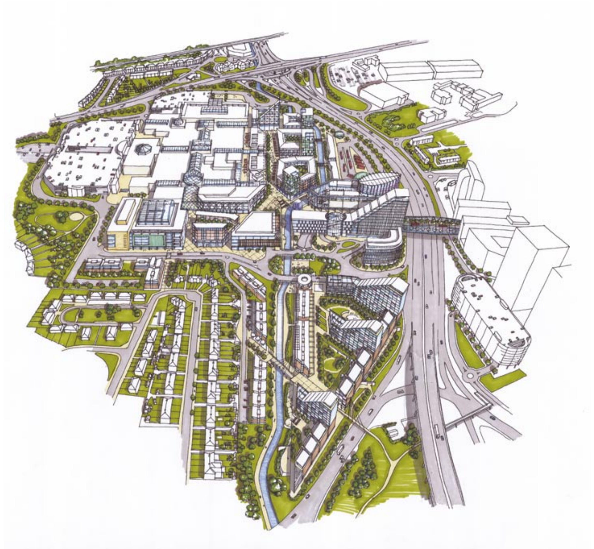
Figure 3: Aerial view of the town centre north