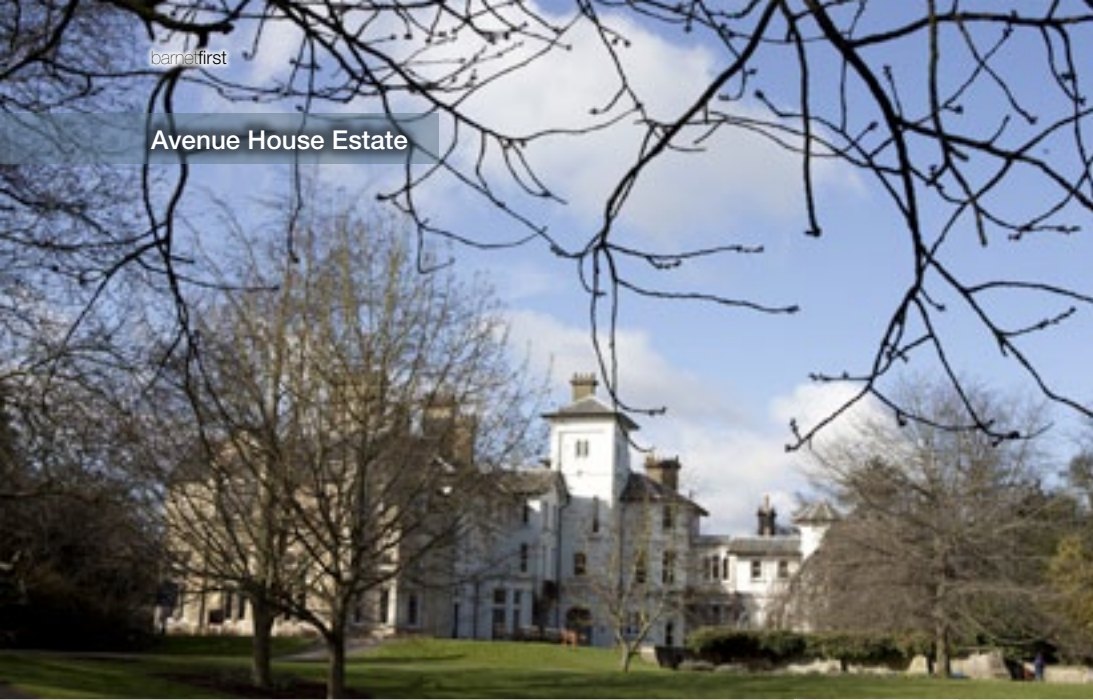
Avenue House Estate