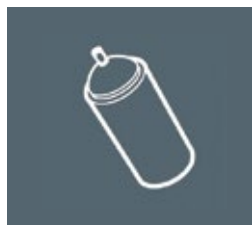
empty aerosol cans