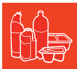
plastic containers, tubs, pots and trays