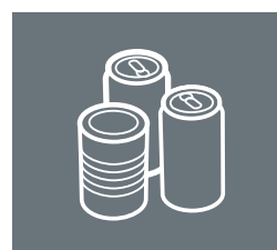
food tins and drink cans