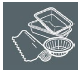
foil and foil trays

If you have your own blue recycling bin or clear recycling sacks Flattened cardboard no larger than one metre squared and clean recyclables in a clear sack can be put out by your blue recycling bin for collection.