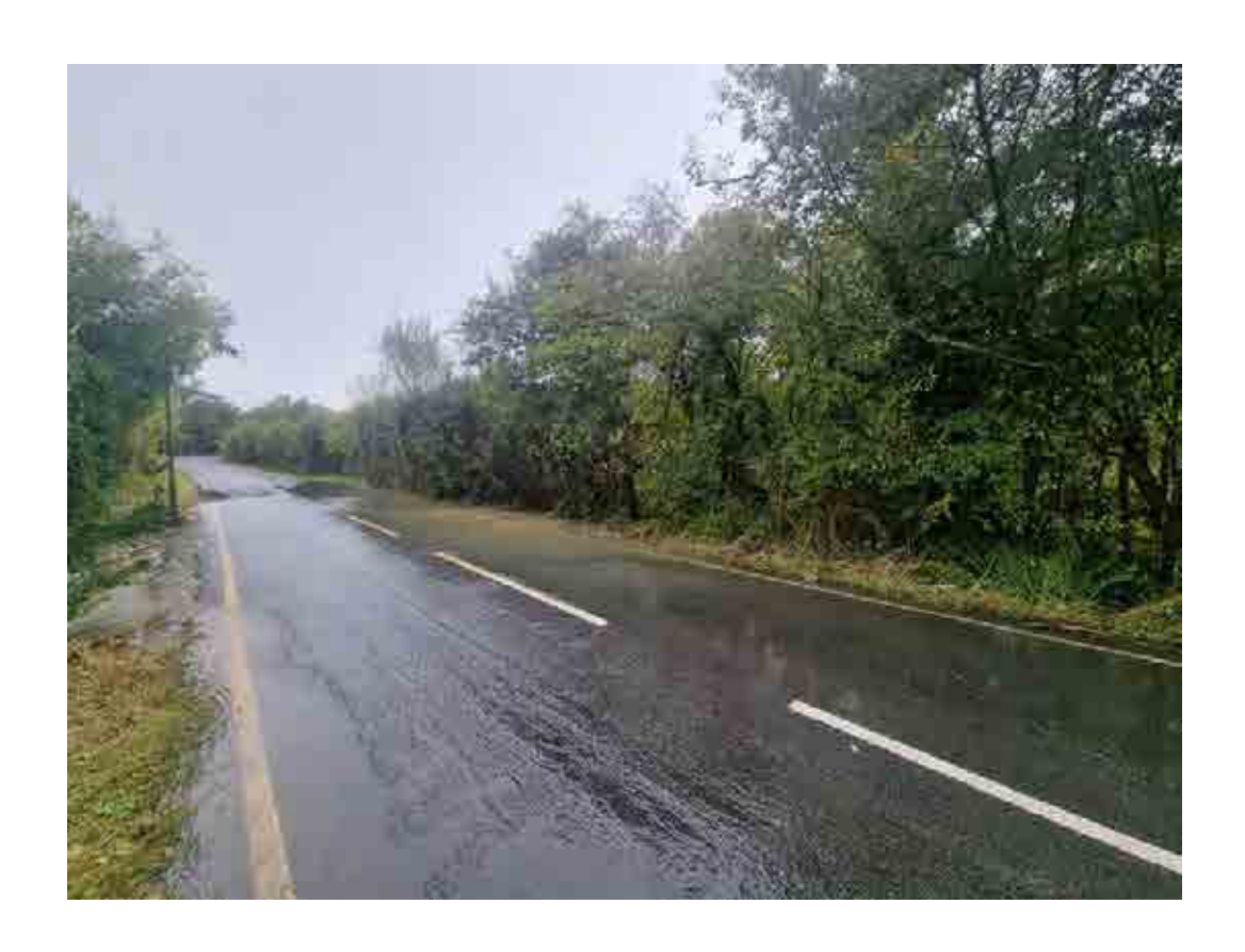
Surface water flooding at appeal site access