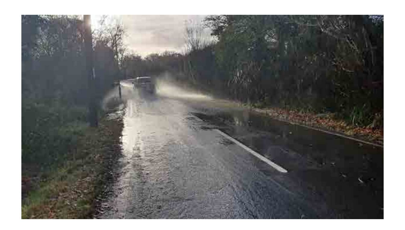
Mays Lane Flooding by Dollis Brook