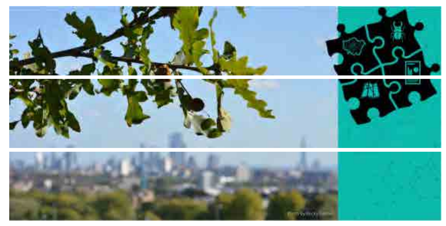
Report reference 2236