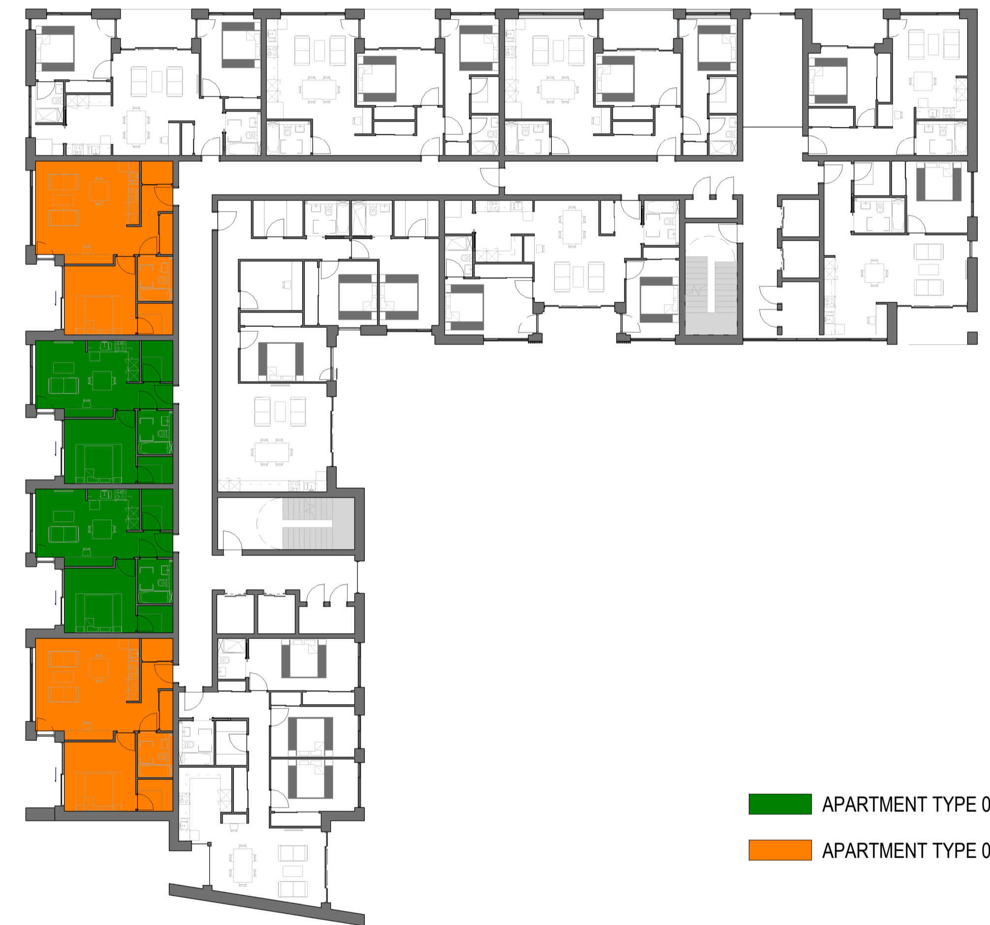
3 Block E_1 Bedroom Apartment Key Plan_Type 01 & 02 1 : 200