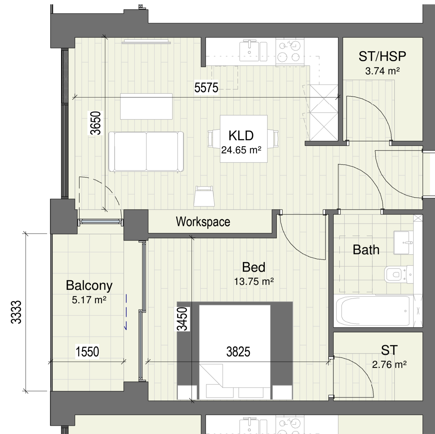
1 Block E_1 Bedroom Apartment Type 01 1 : 50 Size: 50.5m 2 Total Apartments: 6