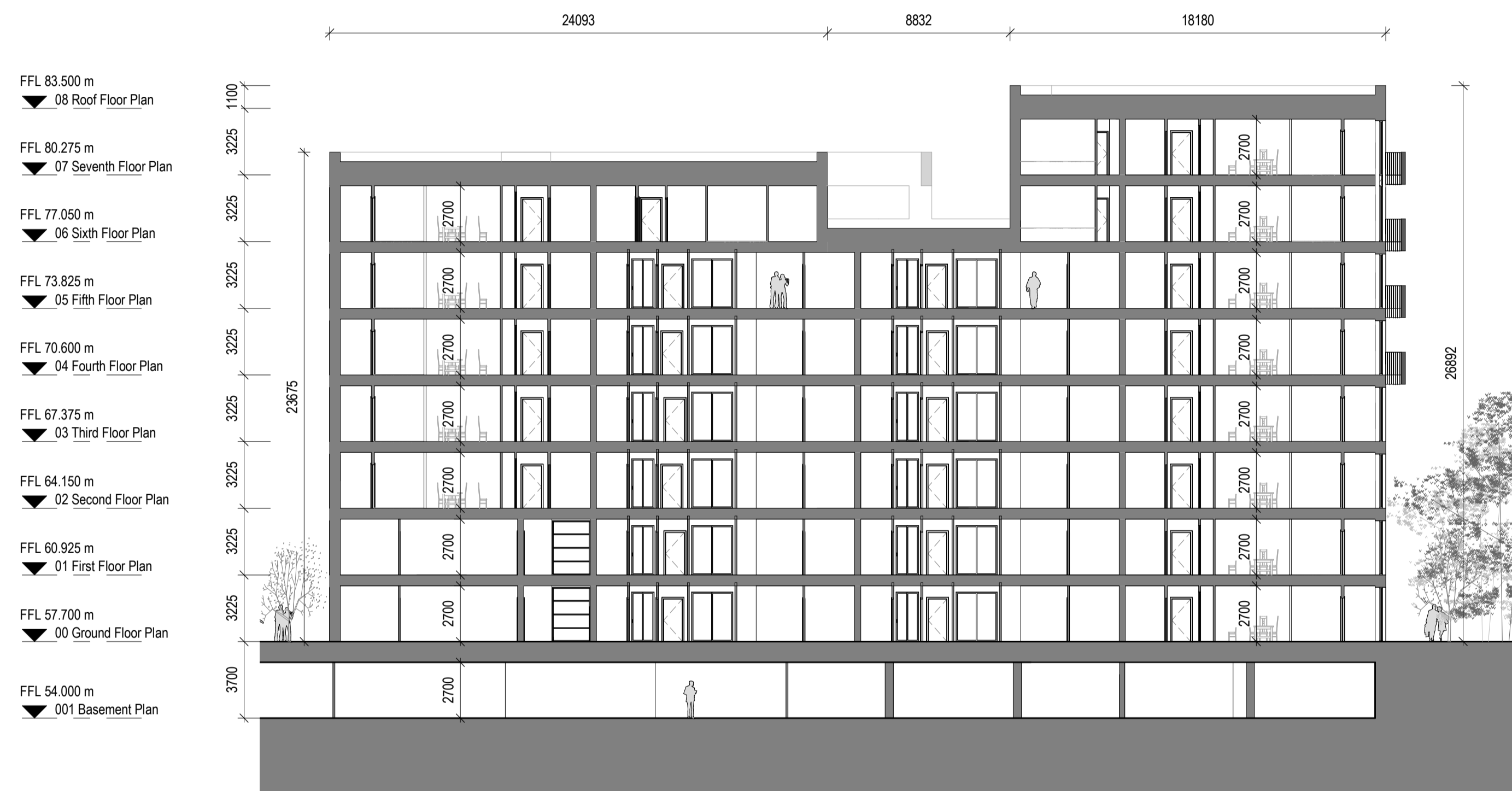
A Block 1E_Cross Section A 1 : 200