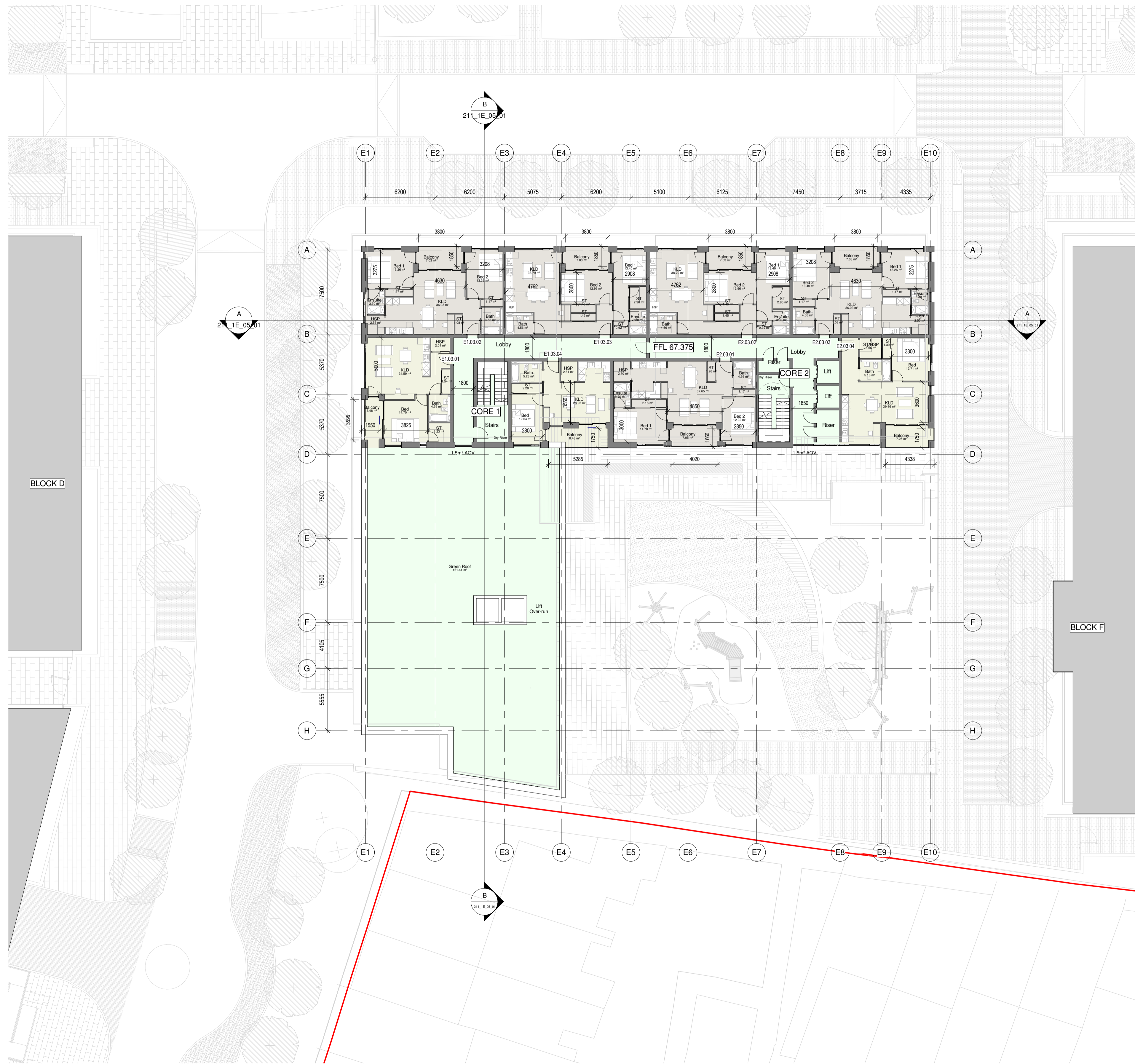
1 Block 1E_Third Floor Plan 1 : 200