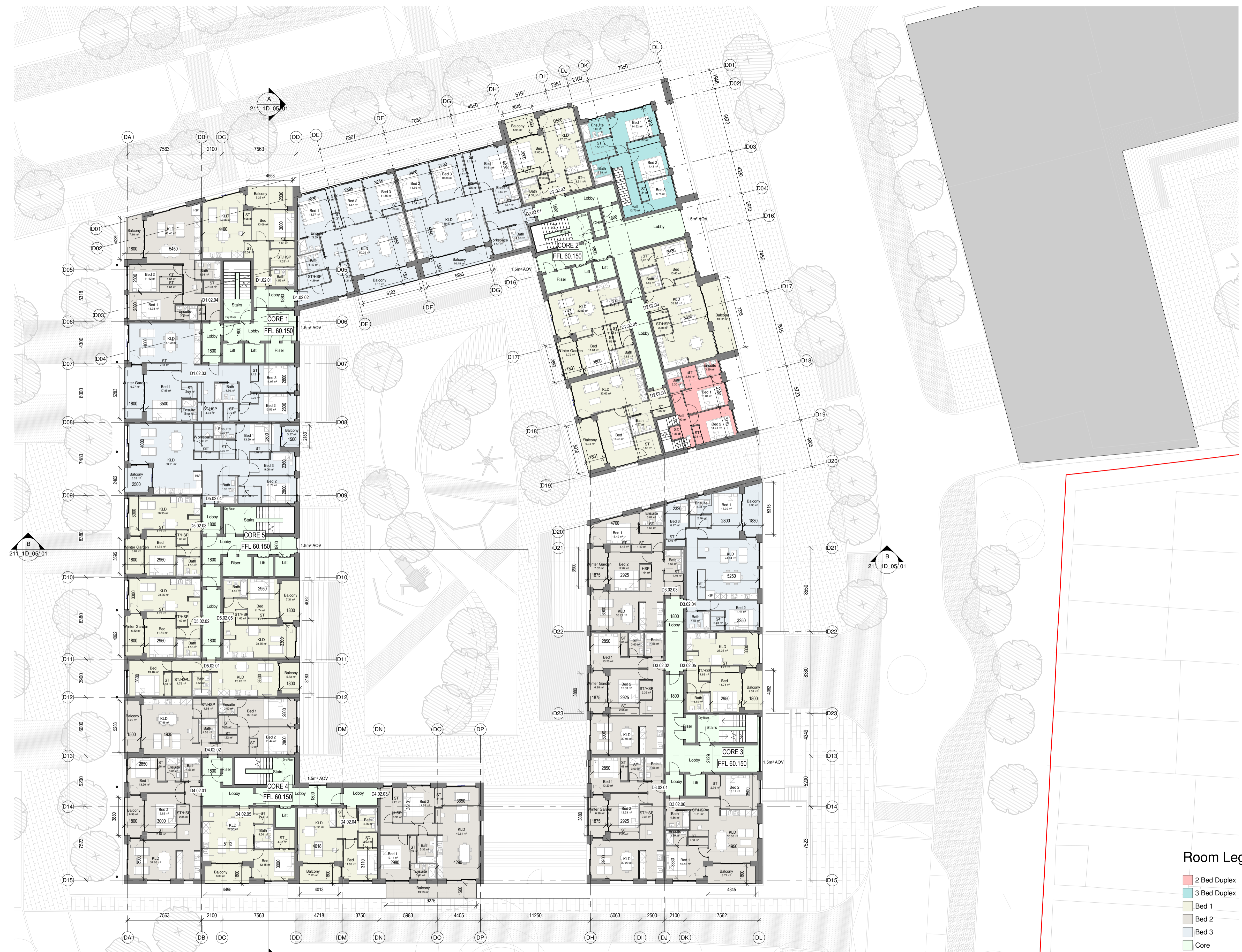
1 Block 1D_Second Floor Plan 1 : 200